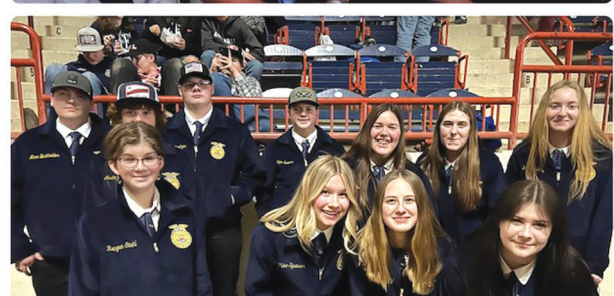
Top - Mifflinburg FFA Members eagerly awaiting to receive their jackets at the PA Farm Show. Bottom - Happy students after receiving their new jackets.

On Monday, January 8, 2024, at the Pennsylvania Farm Show, the FFA Mid-Winter Convention brought students from all over the Commonwealth who were eager to be there because they have earned their blue FFA jackets for the first time. This year, a record 970 students attained this accolade in Pennsylvania. Becoming part of the FFA expresses one's desire to pursue learning skills which will help make them contributing and innovative members of the agricultural community.