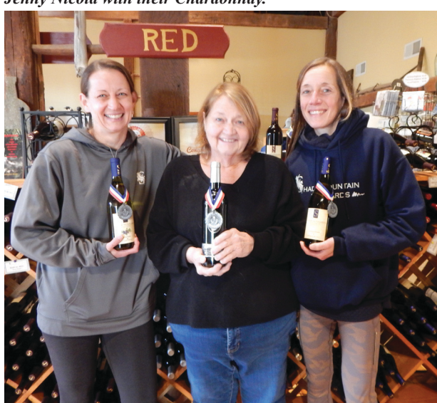
Congratulations to Shade Mountain Winery and Vineyards on their silver medal winners from the 2024 Pennsylvania Farm Show Wine Competition: 2022 Chardonnay, 2020 Proprietor's Red, and 2022 Niagara.

Shade Mountain Winery & Vineyards in Middleburg was awarded three silver medals at the 2024 Pennsylvania Farm Show Wine Competition. Twenty-five wineries from across the state entered the 2024 PA Farm Show Wine Competition. Over 100 wines of various styles were entered in the competition. The Shade Mountain Winery silver winners were their 2022 Chardonnay, 2020 Proprietor's Red, and 2022 Niagara.