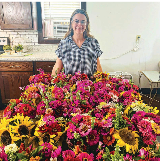
The stunning flower arrangements she delivered brought joy to the residents and brightened their day. Approximately 125 flower arrangement were delivered to three area nursing homes.