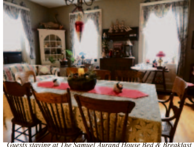
Guests staying at The Samuel Aurand House Bed & Breakfast can enjoy a complimentary continental breakfast with friendly conversation surrounded by vintage charm.

The Samuel Aurand House: Bed & Breakfast & Emporium is a hidden gem in the Susquehanna Valley. Located in New Berlin, the original seat of Union County, the inn is close to Susquehanna University, Bucknell University, wineries, and antique shops. The Samuel Aurand House Bed & Breakfast is perfect for guests attending family reunions, class reunions, holiday visits, Parents Day, graduations, and all the local events including Christkindl and New Berlin Day. Only a block away from Penn Creek, guests can fish, kayak, or relax by the creek at the nearby Commons.