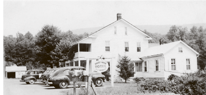
Forest House, one of the oldest continuously operating businesses in Union County, is located west of Forest Hill. It is featured in a real photo postcard, complete with automobiles from the late 1930s.