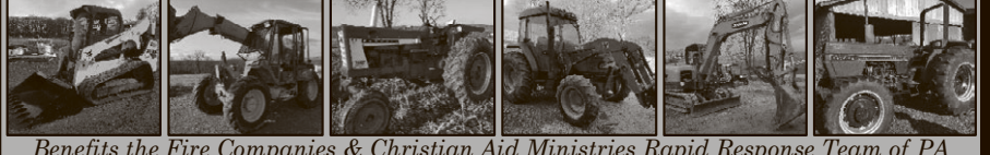
Benefits the Fire Companies & Christian Aid Ministries Rapid Response Team of PA