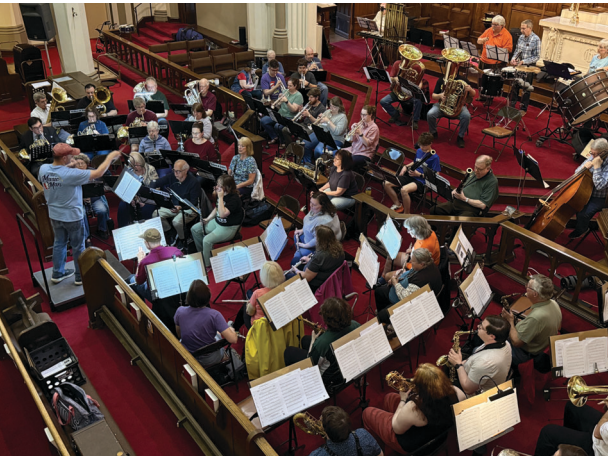
The Sunbury City Band, composed of residents of the Central Susquehanna Valley, performs concerts at churches, retirement communities, nursing homes, and community parks throughout the summer. The Sunbury City Band is always looking for new members.

The Sunbury City Band invites you to its Annual Spring Concert at 3 pm on Sunday, May 18 at the Zion Lutheran Church, located at Market and 5th Streets, Sunbury.