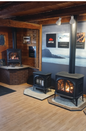
The Sensenig family invites customers to come and browse the Sensenig Gas showroom, located at 1233 Lenig Road in Selinsgrove, for a wide variety of heating solutions, grills, smokers, and propane tanks.

In April, Sensenig Gas celebrated 29 years in business with a Spring Sale offering discounts on everything. Sensenig Gas is Snyder County’s one-stop destination for gas appliances sales, service, and repair.