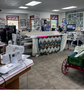
Hoover's Bernina Sew was one of the 8 participating stores in the Mifflinburg Shop Hop designed to promote shopping locally and to encourage customers to explore other businesses in the area.

The third annual Mifflinburg Shop Hop was a success for both shop owners and customers! The stores offered discounts and/or prizes at each location.