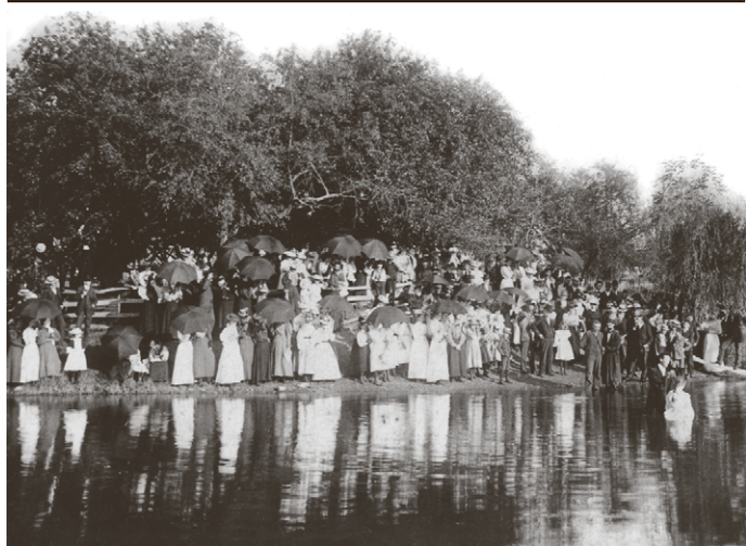
"Located in Gregg Township Spring Garden's millpond was the site for group baptisms, as photographed circa 1905. Local Baptists, organized by Elder Thomas Smiley, first built a log church, then a frame one in 1837."