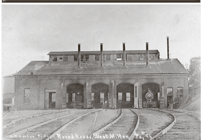
This large brick roundhouse stood just north of West Mil-

ton. The engines did not actually turn at or in the building, but rather used "The Y" that allowed cars to go west on a track, back up and then change engines. An average of 17-19 passenger trains, in addition to freight trains, were serviced each day at the roundhouse. This close-up is one of several real photo postcards by Stephen B. Horton took from 1908-1911.