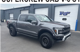
ST#L11564 $94,560 MSRP - $3,229 $91,331