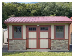
10x16 Quaker $5,994