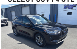
ST#L11571 $38,475 MSRP - $6,717 $31,758