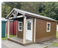
10x20 Cabin $8,099