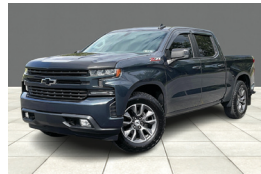
Stock #: 25366B $31,904