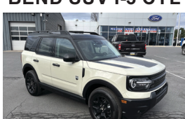
ST#L11381 $36,075 MSRP - $3,652 $32,423