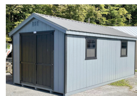
10x20 Workshop $5,649