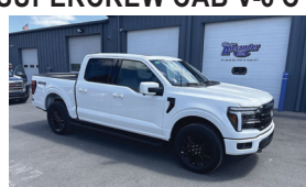
ST#L11578 $77,760 MSRP - $5,090 $72,670