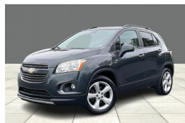
Stock #: 25453A $9,902