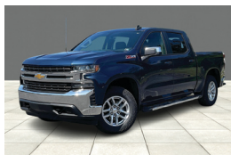
Stock #: 25012A $30,551