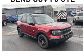
ST#L11270 $36,470 MSRP - $3,684 $32,786