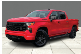
Stock #: 25172A $33,502