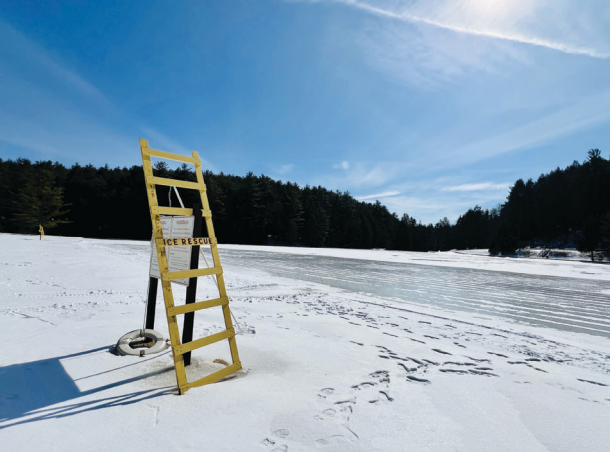
Congratulations to the winner of the “Frame Our World” Photography Contest: first-place- Gary Koppenhaver for his ice rescue beach photo.