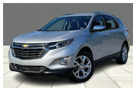
Stock #: 25466A $18,955