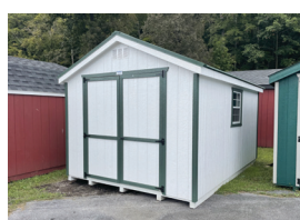
10x14 A-Frame $4,399