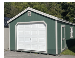
14x24 Garage $9,999