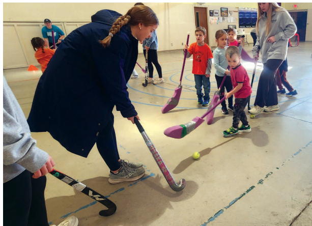
The Mifflinburg Girls Field Hockey team members also volunteered for Sports Day for the second year. "We are blessed to have wonderful volunteers! The kids absolutely love this day, and so do we!"