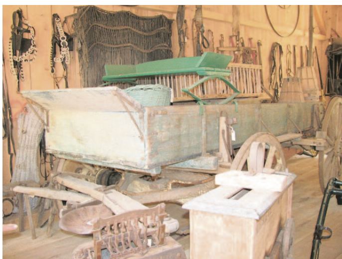
Farm vehicles and equipment in the Wagon Shed at the Dale/Engle/Walker House.