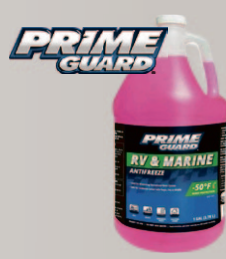
Prime Guard Red Antifreeze $3.19 each (Case of 6)