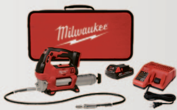
Milwaukee M18 Grease Gun Kit $245.99

*Must be purchased at the event to qualify for discounts