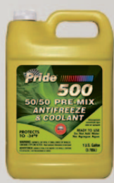
Pride 500 Green Antifreeze $7.25 each (Case of 6)