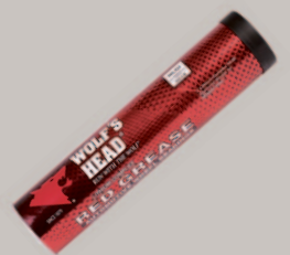
Wolf's Head 14 oz. Red Grease $3.99 each (Case of 10)