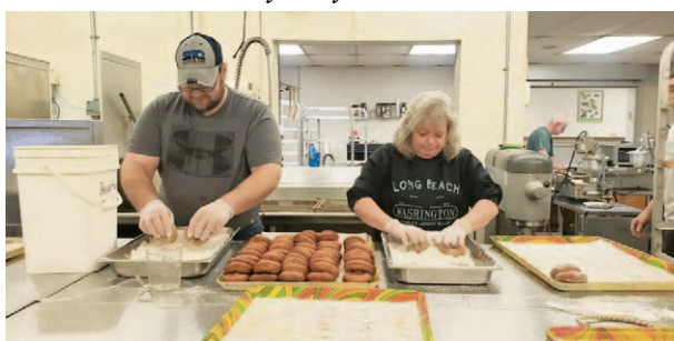
Volunteers coat warm doughnuts with sugar for the annual Doughnut Day fundraiser at Rescue Hose Company in Beavertown.

Doughnut Day has its roots deep in Germany and is a popular Pennsylvania Dutch tradition here in the Valley. Fastnacht Day falls on Shrove Tuesday. Fastnacht is the time to indulge in pastries and rich foods before the Lenten fasting begins on Ash Wednesday. It is a way to use up the lard, sugar, butter, and fat in the kitchen that are off-limits during the 40 days of Lent.