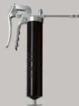
LubriMatic 14 oz. Grease Gun $20.99