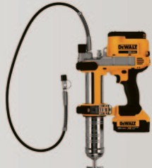
Dewalt Grease Gun $245.99