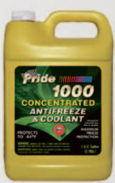
Pride 1000 Green Antifreeze $9.99 each (Case of 6)