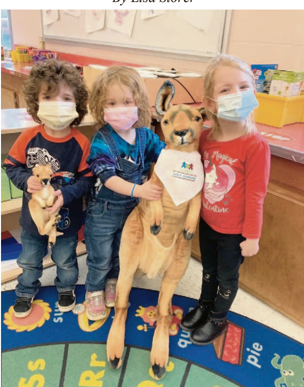
Students at Summit Early Learning enjoy their 3-foot stuffed mascot, Poppy, and her baby Paulie.

For the first time in its 53-year history, SUMMIT Early Learning has a mascot! Poppy the kangaroo and her baby, Paulie, were recently introduced to the children. Each of SUMMIT's five early learning centers and 14 community/school-based classrooms were provided with a 3-foot stuffed Poppy, a children's book (Poppy Can, Can You?), stickers, and a banner!