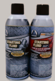
Penray Starting Fluid $3.03