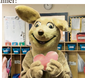
SUMMIT Early Learning introduces its new mascot, Poppy the kangaroo and her baby, Paulie.

Poppy was chosen because kangaroos understand the importance of SUMMIT's mission: Nurture, Educate & Support. They take special care of their babies and Poppy will be at each of SUMMIT's sites, looking for good choices and always willing to give a needed hug.