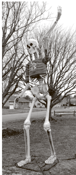
Make no bones about it... Baby, it's cold outside!

WANTED Your Unwanted Vehicle Paying $12.00 Per 100 lbs. cash Instant Cash Also looking for antique cars 570-850-6345