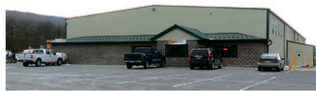
Zeiset Equipment LLC is located halfway between Beaver Springs and McClure. Hours of operation are Monday- Friday from 6:30 am- 6:00 pm and Saturday from 7:30 am- 3 pm.

Zeiset Equipment LLC in Beaver Springs will host their annual Open House & Customer Appreciation Days on March 3-5. The Open House will feature door prizes, discounts, and refreshments. Zeiset opened its doors in Snyder County in August 2020.