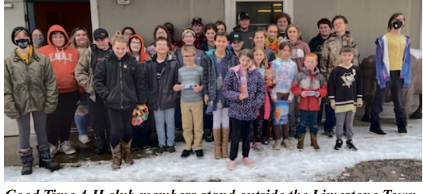
Good Time 4-H club members stand outside the Limestone Township Building with the donations they collected for Mazeppa Manna, Arthur's Pet Pantry and The Beacon Ministries Free Shop.