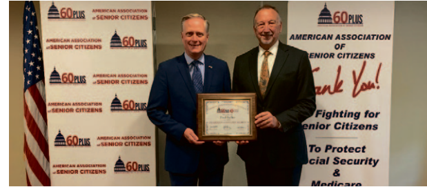
Congressman Fred Keller (left) receives award from the 60 Plus Association.

Recently, Congressman Fred Keller (PA-12) received the Guardian of Seniors' Rights award from the 60 Plus Association for his strong legislative record of support for America's seniors.