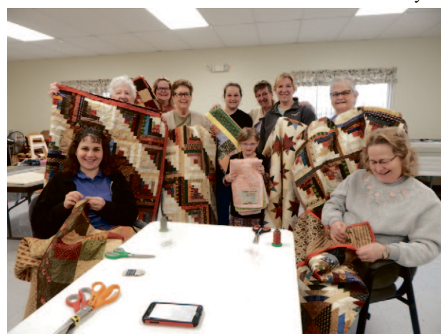
Members of the Embrace Hope Project Comfort Quilts by Friends of Evangelical Community Hospital met recently to work on donations for End of Life patients and their families.