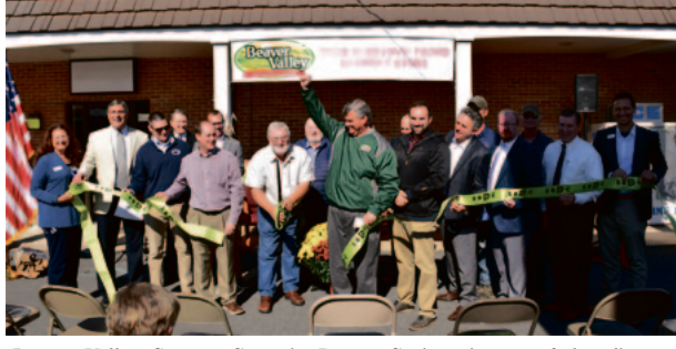
Beaver Valley Country Store in Beaver Springs is one of the clients that accessed the no-cost educational programs and one-on-one expert consulting services of Bucknell's Small Business Development Center (SBDC) as they took steps to plan and launch their new company.

Businesses of the region have felt many negative impacts and faced significant challenges throughout the two years of the COVID-19 pandemic, but for 68 small business owners, the future looks bright!