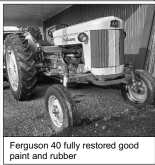
Ferguson 40 fully restored good paint and rubber

1913 2 hp IHC Famous engine. This engine was purchased new by the Atlas cement company and powered the shop at Northampton Pa. It frost cracked there and has a neat, well done repair by the Atlas shop men. We don't know when it was taken out of service but eventually it ended up in the hands of an engine enthusiast. The engine also has an old repair on the water pump bracket. It seems to have been well maintained, has good compression. It has the uncommon Sumpter gear drive magneto and also has its original oil sight glass. It will be on a quality original style cart by Cattail foundry at time of sale.