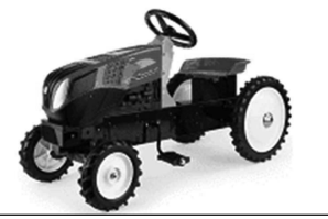
Pedal Tractor T8 435 New Holland

John Deere B with three point hitch complete. Good rubber and runs well. Thinking mid 1940 possibly 1945. Paint good to fair.