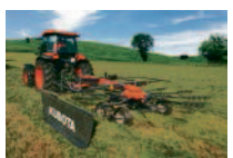
Disc Mower Conditioner

10% OFF Total Parts Order Excludes Powered Handheld Equipment