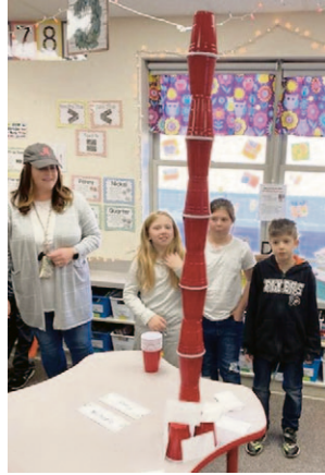
Success! 4th grade students at Mifflinburg Intermediate show off their STEM skills by creating a Cat in the Hat tower.