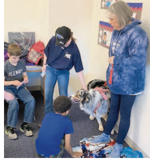
Maverick, the reading dog, is eager to be a reading companion during the 4th grade visit to the Union County Library station. Mifflinburg Intermediate celebrated Read Across America Week with lots of fun and educational activities to promote a love of reading.

Read Across America celebrates the joy of reading and promotes a love of books. Mifflinburg Area Intermediate School celebrated Read Across America Week from February 28– March 4. Students celebrated Dr. Seuss's birthday on Wednesday, March 2 and extended the celebration throughout the week.