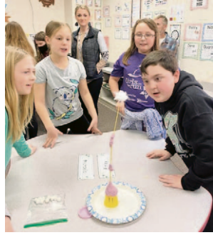
5th grade students at Mifflinburg Intermediate are trying their hand at a Dr. Seuss STEM challenge.