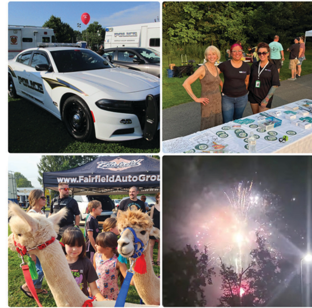
Top left photo - A Buffalo Valley police cruiser. Top right photo - Representatives of Transitions had a booth offering helpful information for attendees. Bottom left photo - Alpacas, Sergio and Rein, of Country Vale Alpacas of New Columbia, delighted both children and adults. Bottom right photo - An awesome fireworks show by Just Lite It ended the night with a bang.

The community of Lewisburg came together on Tuesday, August 5, 2025, to celebrate this year's National Night Out. Held at Saint Mary Street Park, the annual community-building campaign brought neighbors, local law enforcement, and emergency responders together to interact and strengthen relationships within the Lewisburg and Union County community. National Night Out is a nationwide initiative held annually in August designed to enhance the connection between residents and the police officers and other first responders who serve them. The Lewisburg event, which ran from 5:00 p.m. to 9:00 p.m., provided a perfect opportunity for these positive interactions where over ninety-five different agencies were represented. Families and individuals of all ages enjoyed a wide array of free activities which included live police K9 and martial arts demonstrations, an alpaca petting zoo, a dunk tank, and a vehicle extrication demonstration by the fire department. Attendees had the chance to meet and interact with local police officers, firefighters, emergency medical services personnel, and even see a Life Flight helicopter. These important public