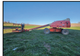
JLG 400S Manlift 40ft. $30/hour