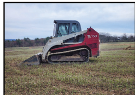
Takeuchi TL150 Track Skidloader 96HP $35/hour