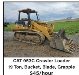
CAT 953C Crawler Loader 19 Ton, Bucket, Blade, Grapple $45/hour