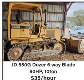
JD 550G Dozer 6 way Blade 90HP, 10ton $35/hour