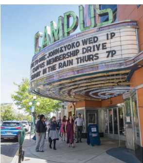
Visiting officials stroll down scenic and historic Market Street during the Main Street Matters tour of Lewisburg.

Recently, Downtown Lewisburg showcased its “Main Street” to officials from Lt. Gov. Austin Davis’s office. The purpose of the Main Street Matters program is to fulfill a key promise to help revitalize downtowns, support small businesses and strengthen