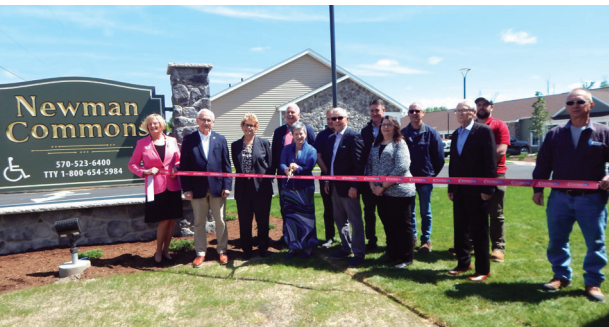
On May 20, 2025, a Ribbon Cutting Ceremony was held for Newman Commons, located at 426 Newman Road in Lewisburg, across from Lewisburg Area High School. Newman Commons, an affordable and accessible senior living community, consists of 44 first-floor cottages units designed to serve seniors ages 62 and older.