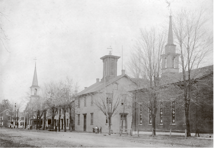
The Emmanuel United Church of Christ in the foreground as it looked before it was rebuilt between 1912 and 1913, and the Evangelical Church down the street while it still retained its steeple; also, the 1814 Union County courthouse.