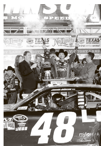
Jimmie Johnson celebrates his second win in a row at Texas Motor Speedway.

At least that's the case if you look at the new 13-race television package Fox signed with NASCAR. It's worth $300 million per year. That's up from the current contract of $200 million.