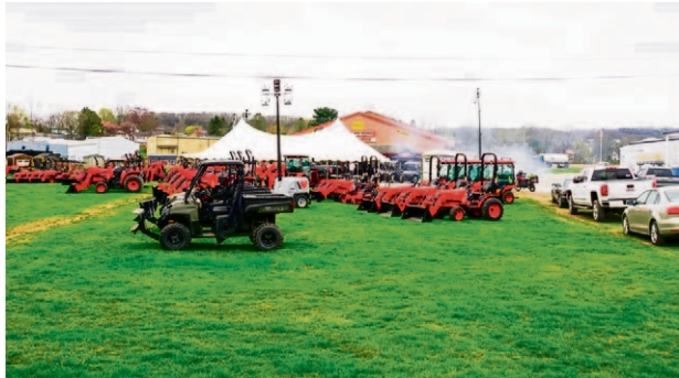
Jo's Equipment Semi-Annual Sale Days are being held on Friday, April 8 and Saturday, April 9. Stop by for the huge savings, giveaways, and free lunch! Jo's Equipment is located along Rt. 15 near Winfield. See display ad for more details.

Jo's Equipment in Winfield is once again gearing up their Spring Sales Days on April 8-9. You don't want to miss this event with huge savings on their massive selection of Dewalt Power Tools as well as Zero Turn & Tractor demos. Stop by and meet manufacturer representatives. There will be big giveaways, door prizes, and a free lunch of sausage and burgers. A BBQ Chicken and Pulled Pork donation dinner to benefit the Union Township Fire Company will be held on Friday from 5-9 pm!