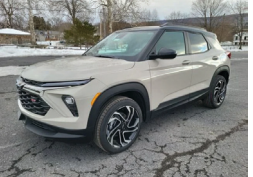
2026 Chevrolet Trailblazer RS