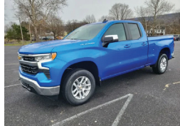
2026 Chevrolet Silverado 1500