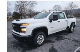
2026 Chevrolet Silverado 2500 HD