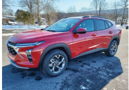
2026 Chevrolet Trax LT