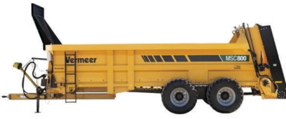
VERMEER MSC800 SPREADER