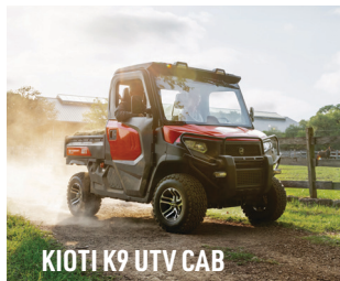
KIOTI K9 UTV CAB

NEW MX SERIES EXCAVATORS ORDER YOURS TODAY!