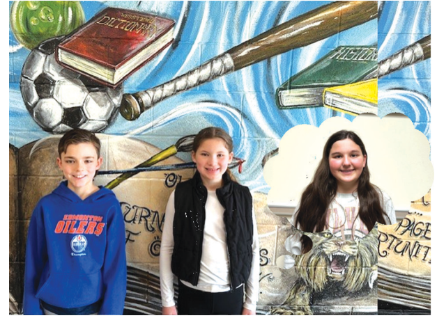
Congratulations to the March 2026 Students of the Month from the Mifflinburg Area Intermediate School!