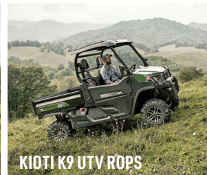
KIOTI K9 UTV ROPS