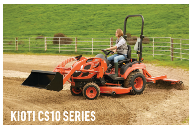
KIOTI CS10 SERIES