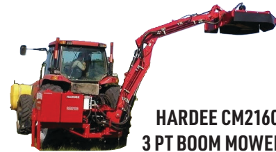
HARDEE CM2160 3 PT BOOM MOWERS