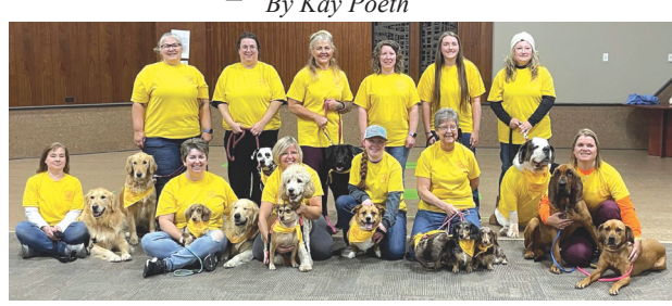
Handlers and their canines from the Tri-County Obedience Dog Training Club and Precious Paws Crisis Response Team are shown in the photo. Donations are gratefully accepted.

The Precious Paws Response Crisis Response Team meets in Selinsgrove. The handlers and their canines have dedicated thousands of hours training to work in crisis situations.