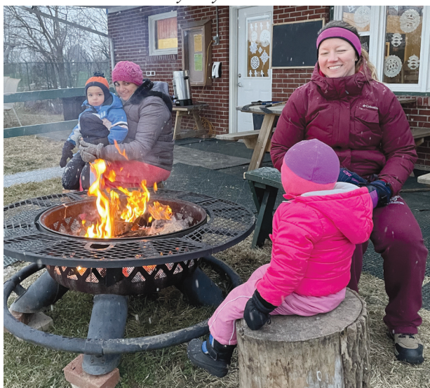
Patrons relax around the fire pit after a day of ice skating at the Lewisburg rink.