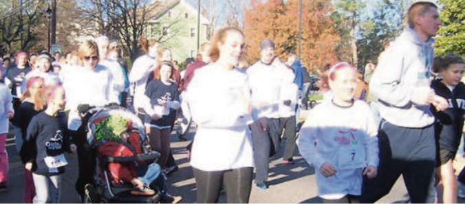
Runners pounded the pavement at Girls on the Run 5K Challenge.

The November 17 event was the culmination of 10 weeks of training in the Girls on the Run program. The race weaved through the borough of Selingsgrove with a grand finish at Lopardo Stadium at Susquehanna University. Awards were given to male and female overall and age group winners. The GOTR 5K Challenge also featured a sport and sponsor expo in the field house before and after the race.