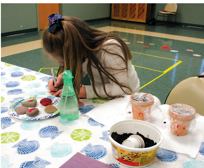
Young gardeners participated in a special program, "Planting Seeds of Kindness," sponsored by the Susquehanna Garden Club.