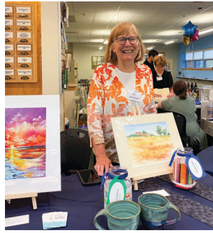
Lewisburg – The Public Library for Union County

is just days away from hosting its 35th Annual Auction & Social, An Evening Among the Stacks, on Saturday, September 20, 2025. Join us for a night filled with energy, community spirit, and support for your local library.