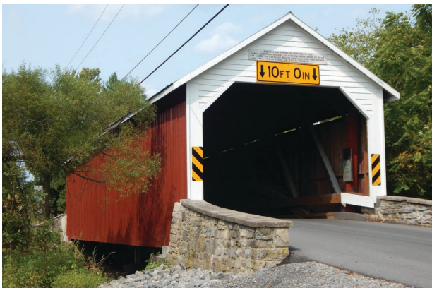
Built 200 years ago, Hassenplug Covered Bridge is one of the oldest covered bridges in the United States.