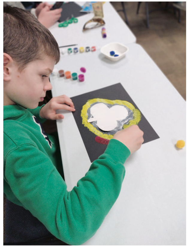
Participants created shamrock art during a recent Make it Mondays 4-H Club meeting.

The 4-H year has started off with a great turnout of members, previous and new! But it is not too late to join! We have two new clubs this year that may be of interest to your family. Youth, ages 5-18, are invited to join our 4-H Make it Mondays opportunity. This club will meet at the 4-H Office beginning at 5 pm once a month. Using supplies provided, participants will create an item based on the monthly theme. This club has already created art projects, valentines and planted clover. Upcoming activities include textiles, succulents, a garden center tour, leathercraft, tie dye, and STEM projects.