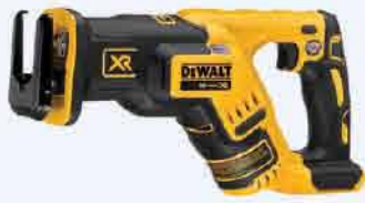
Brushless Reciprocating Saw - Bare Tool $199.99