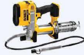
Grease Gun - Bare Tool $229.99