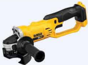
Angle Grinder - Bare Tool $149.99