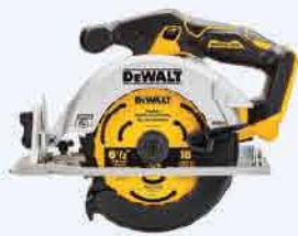
Circular Saw - Bare Tool $199.99