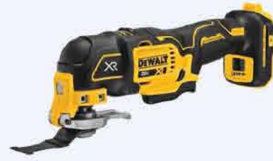
Oscillating Multi-tool - Bare Tool $149.99