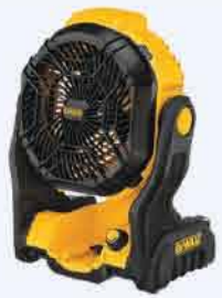
Cordless Jobsite Fan $129.99