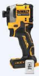
Atomic Impact Driver - Bare Tool $149.99