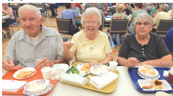
189 guests gobbled up delicious goodies at the Peach Festival hosted by Mifflinburg United Methodist Church. All donations benefit the Mifflinburg Area Schools Weekend Backpack Food Program.

Everything was "Just Peachy" as tables filled quickly for the Annual Peach Festival recently celebrated at Mifflinburg United Methodist Church. 189 people attended this free event. Guests enjoyed hamburger BBQ, hot dogs, peach or vanilla ice cream, peach iced tea, and of course, peach pie! There were also a variety of pies, from crumbs and cobblers to classic double crust. All the food served was provided by donations.