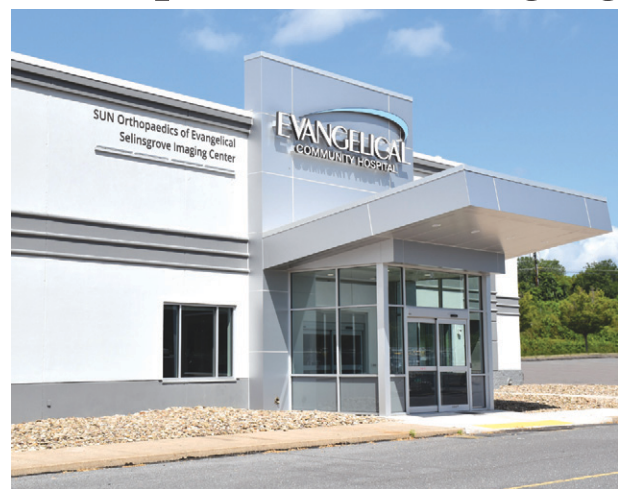
The entrance at of Selinsgrove Imaging Center and SUN Orthopaedics of Evangelical-Selinsgrove at the new mall location.