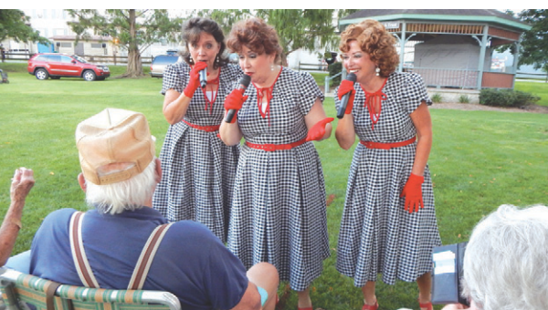
Patsy Cline & Friends performed at the Mifflinburg Community Park. The sisters stepped off the stage and out into the audience!

DRIVEWAY SEALING Hand Brushed! Premium Sealer. Neatly Done. Affordable! 52 years experience. Reliable. Call (570) 837-6301