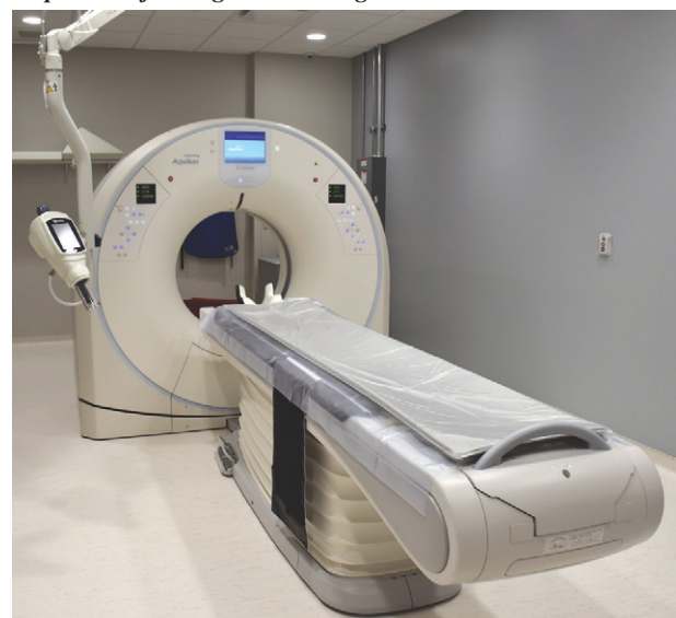
A CT/CTA scanner at the location is a newly purchased model that is state-of-the art and offers shorter scan times, reduced patient dose of radiation, and has improved image quality. The larger bore model improves comfort for patients of larger size or who can experience anxiety while being in tight spaces. For orthopaedic patients the CT CTA technology at the new location offers a metal artifact reduction technique that creates unobscured images during orthopaedic imaging.

Beginning Monday, August 14, patients of the area can take advantage of greater accessibility to SUN Orthopaedics of Evangelical-Selinsgrove and the Selinsgrove Imaging Center. Both service offerings, previously located at 21 Susquehanna Mall Drive will now be open in their new location at the former Sears location of the Susquehanna Valley Mall.