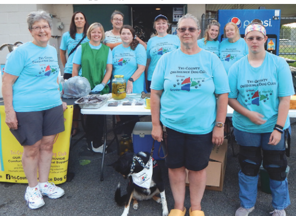
Tri County Obedience Dog Club provided food for hungry concert-goers. The funds will benefit the Precious Paws Dog Program that provides visit to various organizations.