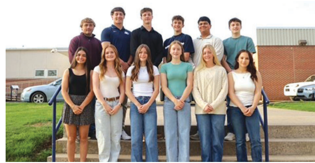
Congratulations to the members of Mifflinburg's 2026 Prom Court!