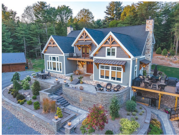
Timberhaven, has earned a prestigious Gold award in the 2025 Best in American Living™ Awards (BALA) for their work on the Davis Timber Frame Home.