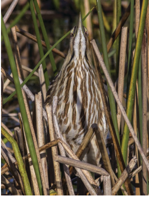
American bittern.

I want to kind the praises of an intense kind of birding experience: having a patch.