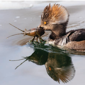
Immature Hooded merganser.