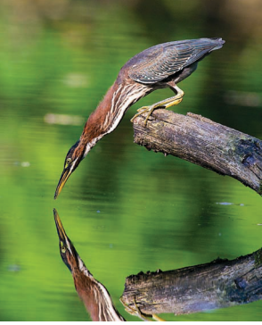
Green heron.