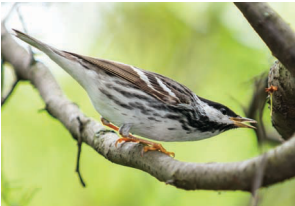
Blackpoll warbler. Audubon Photography Award 2017, by Owen Deutsch.