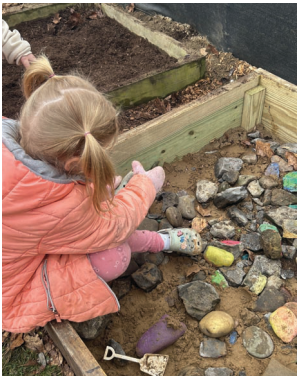
No matter what the season, for children “playing outside builds confidence, teaches teamwork, and reduces challenging behaviors. Overall, it helps children grow, learn, and feel connected to the world around them.”