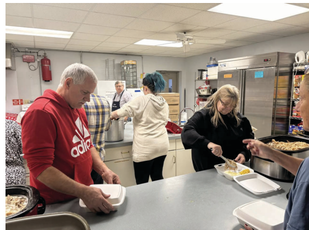
Volunteers work in the kitchen to prepare meals for Feed 500 for Thanksgiving.