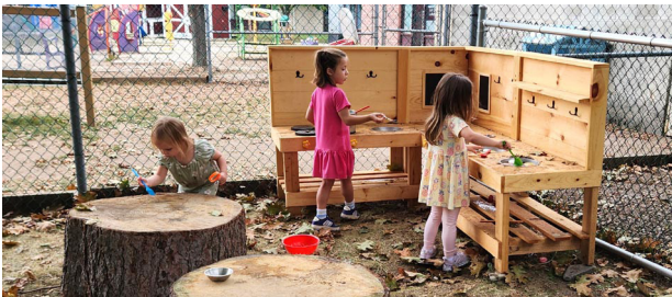
The Outdoor Learning Environment offers many different ways to engage the children.