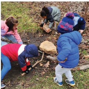
Children collaborate and discover how to move a mini-boulder in the nature play area at the Lewisburg Center.

On brisk November morning, the Outdoor Nature Playground at SUMMIT Early Learning was filled with laughter, engagement, collaboration, and learning. Two girls carried a long stick together up the hill and over a bridge. Then they switched who was in the lead. Others were playing in the mud kitchen at one end of the play area. A boy was busy analyzing how to move a mini-boulder in the yard. Soon, he was joined by five other children. Together, they engineered a way to lift the heavy stone using a stick. They moved it several feet away. Teachers were observing as the children were actively engaged in a number of activities.